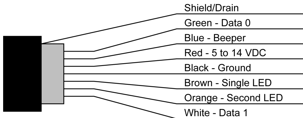
Figure 1: Wiring Connections